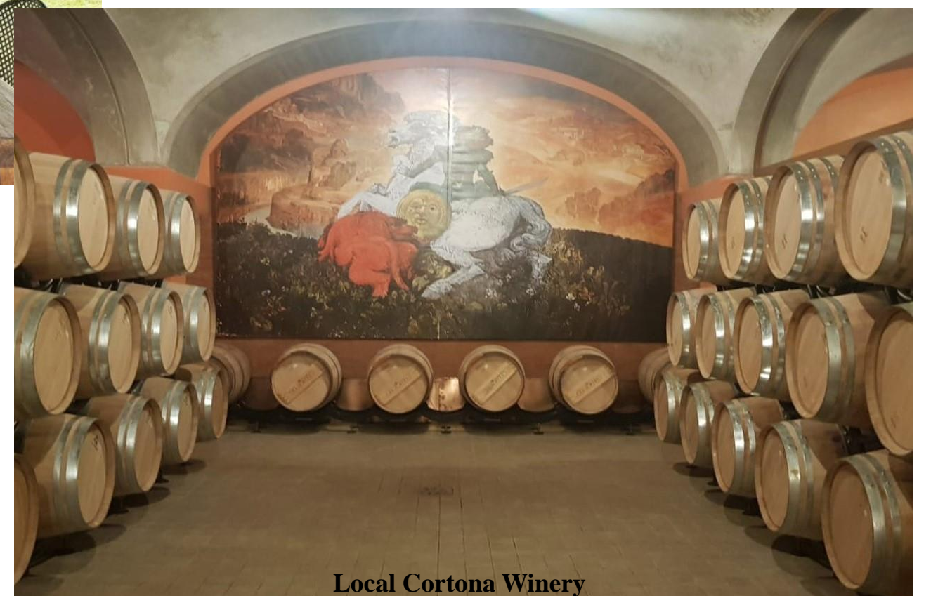
Local Cortona Winery

Please Note: Travel needs to be booked within one year and travelled within two years. As well, travel must be booked a minimum of 60 days in advance and reservations are subject to availability. Once booked, all reservations are final. Photos shown are examples only and actual lodging may vary, as multiple comparable properties with the same quality standards are used in order to insure availability. With our apologies, these properties are not wheelchair accessible. Visitors tax of approximately $10 per person will be required by Cortona's Municipality upon arrival. All certificates should be handled with care as they are needed to book your stay. This package may not be re-sold or offered for bidding at any other auction.