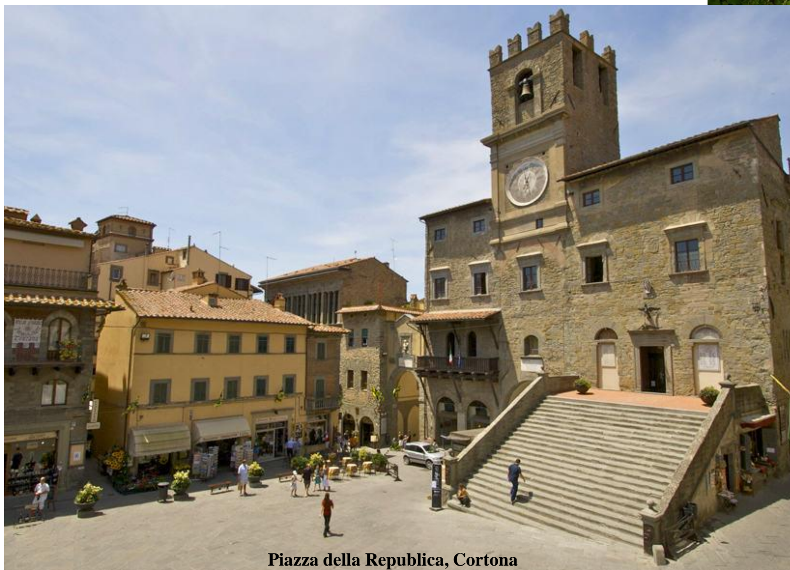
Piazza della Repubblica, Cortona